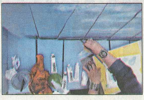
See ARTIST, Page 3

D'Agostino says the bench will include a surprising element that she is keeping secret for now.